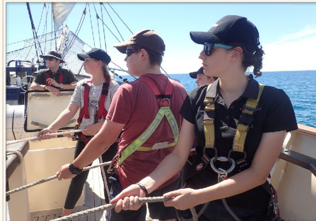
Getting ready to sail