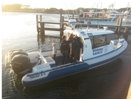
BBQ, beers & an afternoon cruise on the DoT boat

Various fun days utilising the BBQ trailer to Hell fire bay with DG Melody & John Kevan in late September, Adventure land park, Bandy Creek boat harbour with rides on patrol vessel all different venues and a change from the Pier hotel. Personally the Pier hotel & staff are hard to surpass but club member cooked black angus steaks on our own BBQ's cook up pretty well.