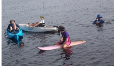
On the Oldfield, paddling, swimming, kids & dog