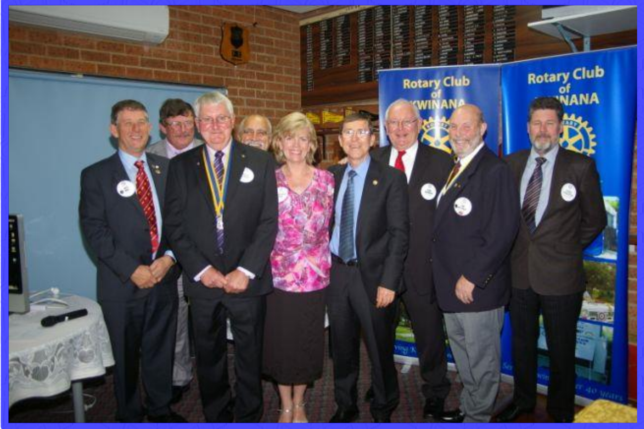
The Team for 2013-14