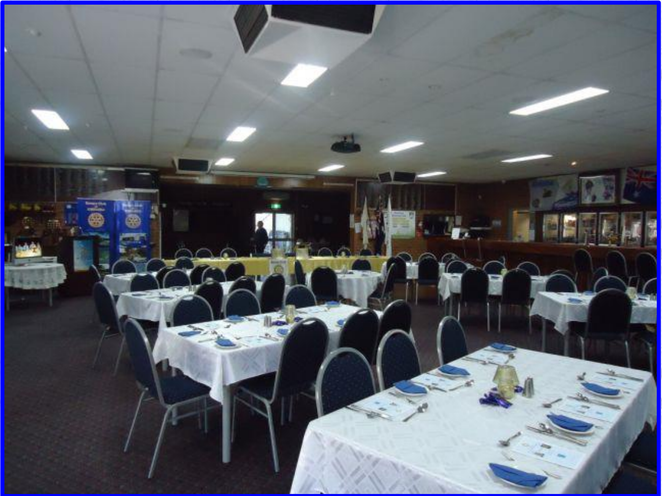
The Venue looked outstanding