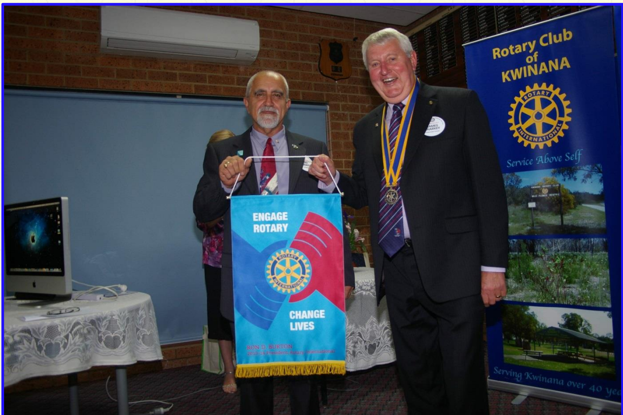
A little walk down memory lane