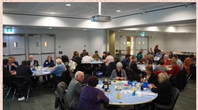
Enjoying the fellowship