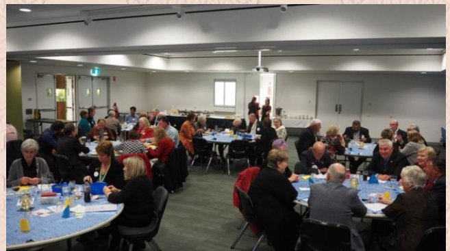
Plenty of atmosphere!