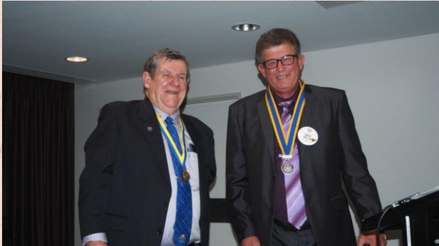
Just handed over the reins to the new president!