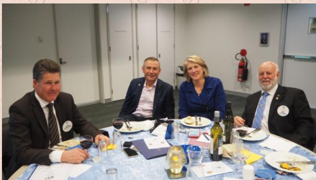
Our illustrious guests and members