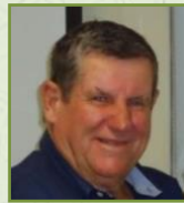
PP Max Bird Foundation Dir.