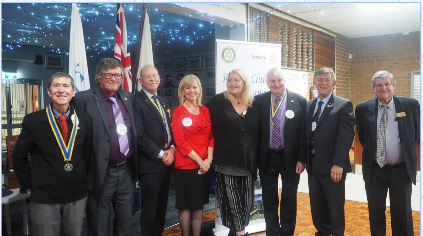
The 'Team' for 2021/2022