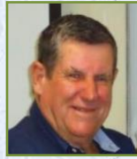
PP Max Bird Foundation Dir.