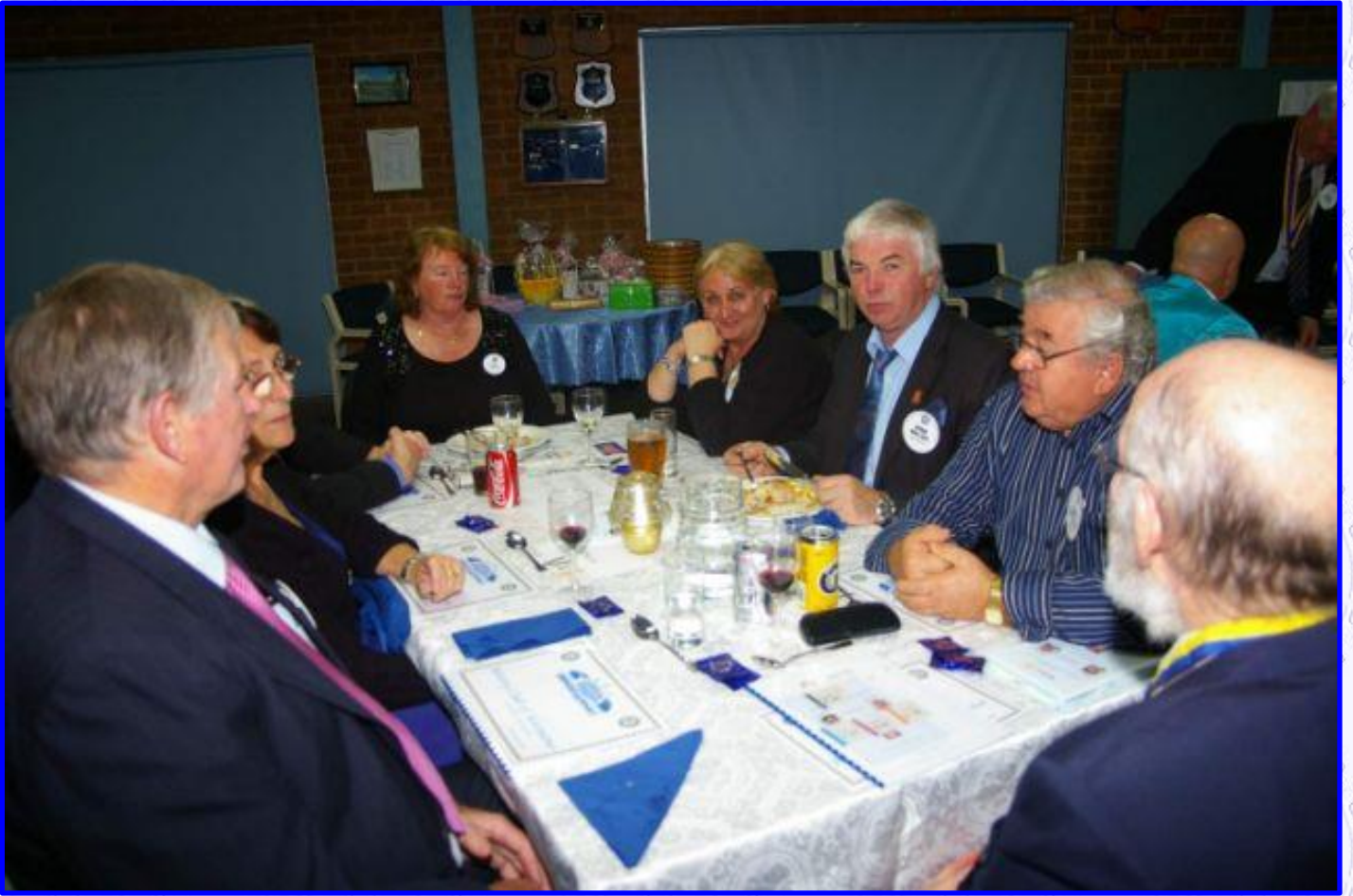
Some of the assembled members, partners and visitors