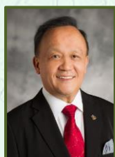
Rotary International President