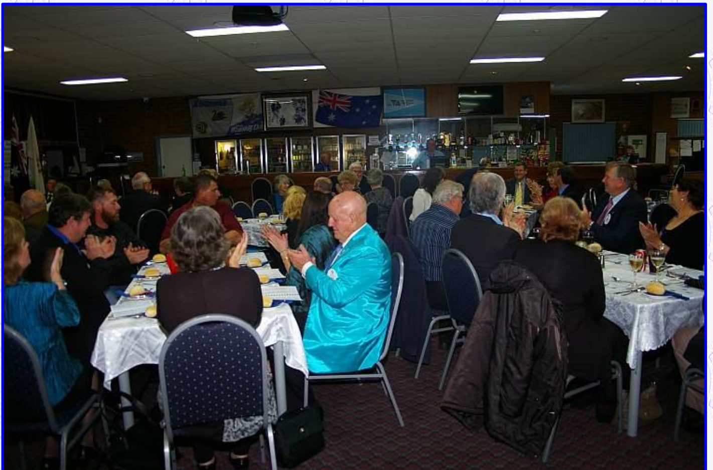
Someone has said something worthy of a clap