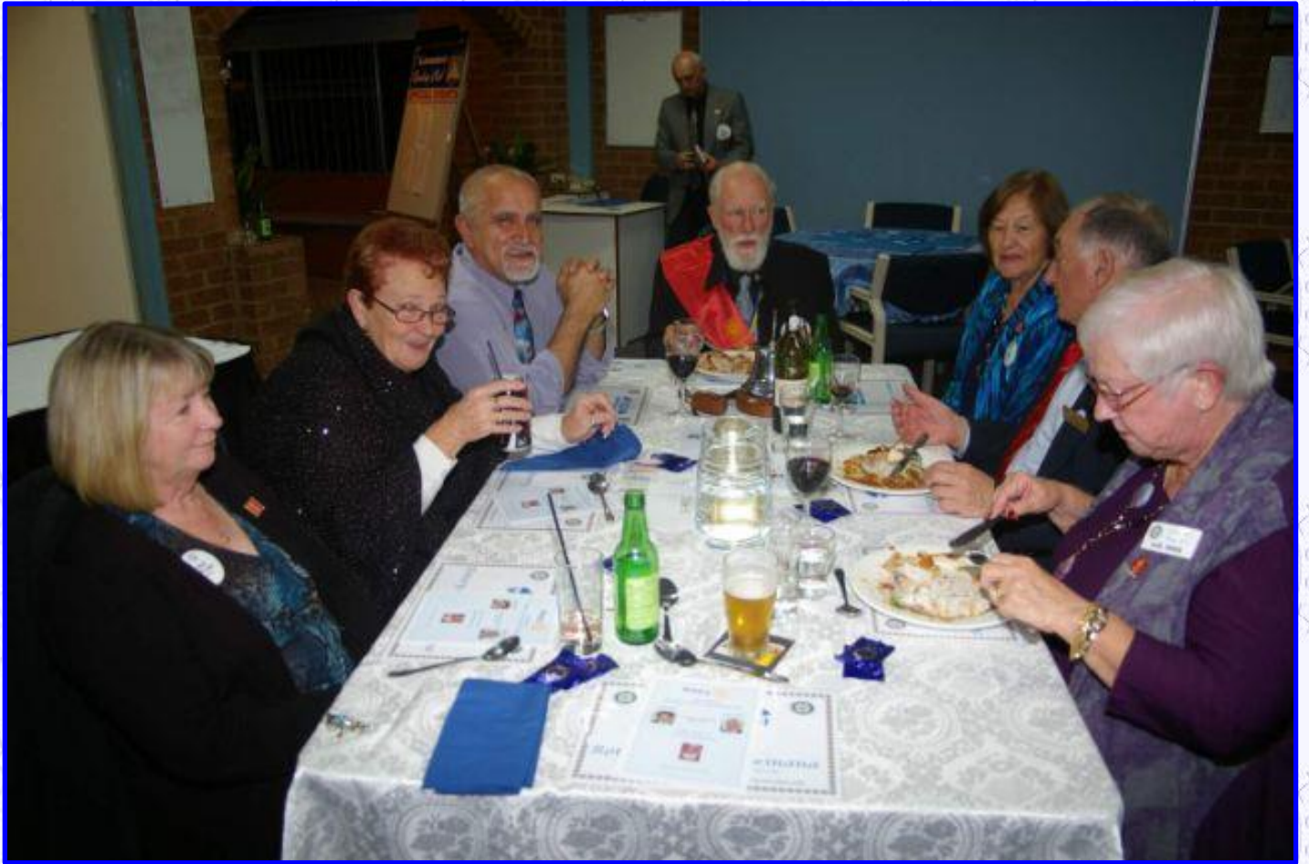
More of the same