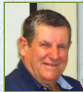
PP Max Bird Foundation Dir.