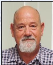
Peter Schulz Vocational