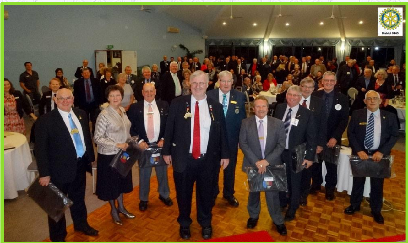
The District Team for 2013/2014

Board meeting scheduled for Tuesday 16 th July has been rescheduled to Wednesday 24 th July.