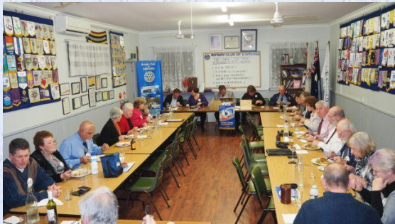
A good turn-out at the DG's visit