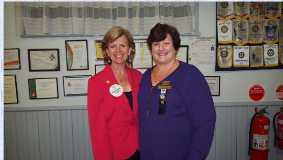
Pink and purple rules!!!