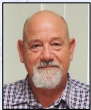
Peter Schulz Vocational