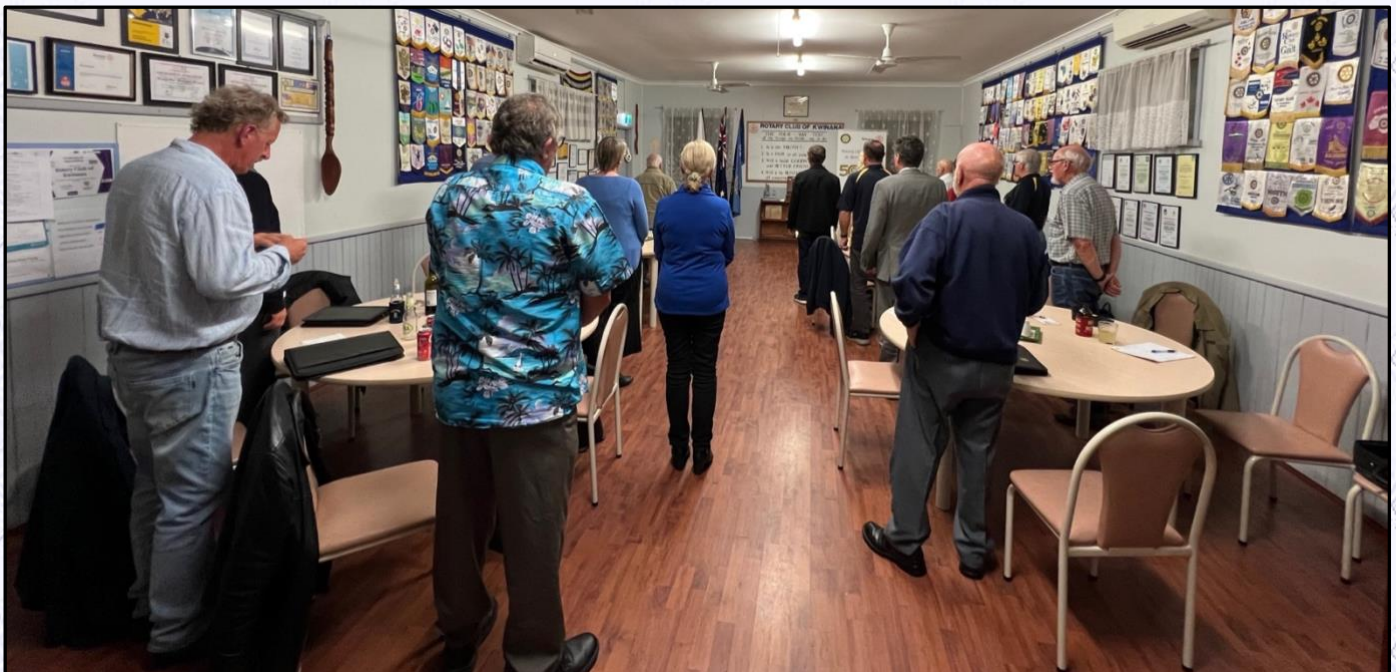
Meeting Monday 7 th August 2023 Picture with a difference, "Facing the flag".