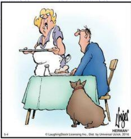
"I don't know how you manage to eat all my cooking and never put on any weight."