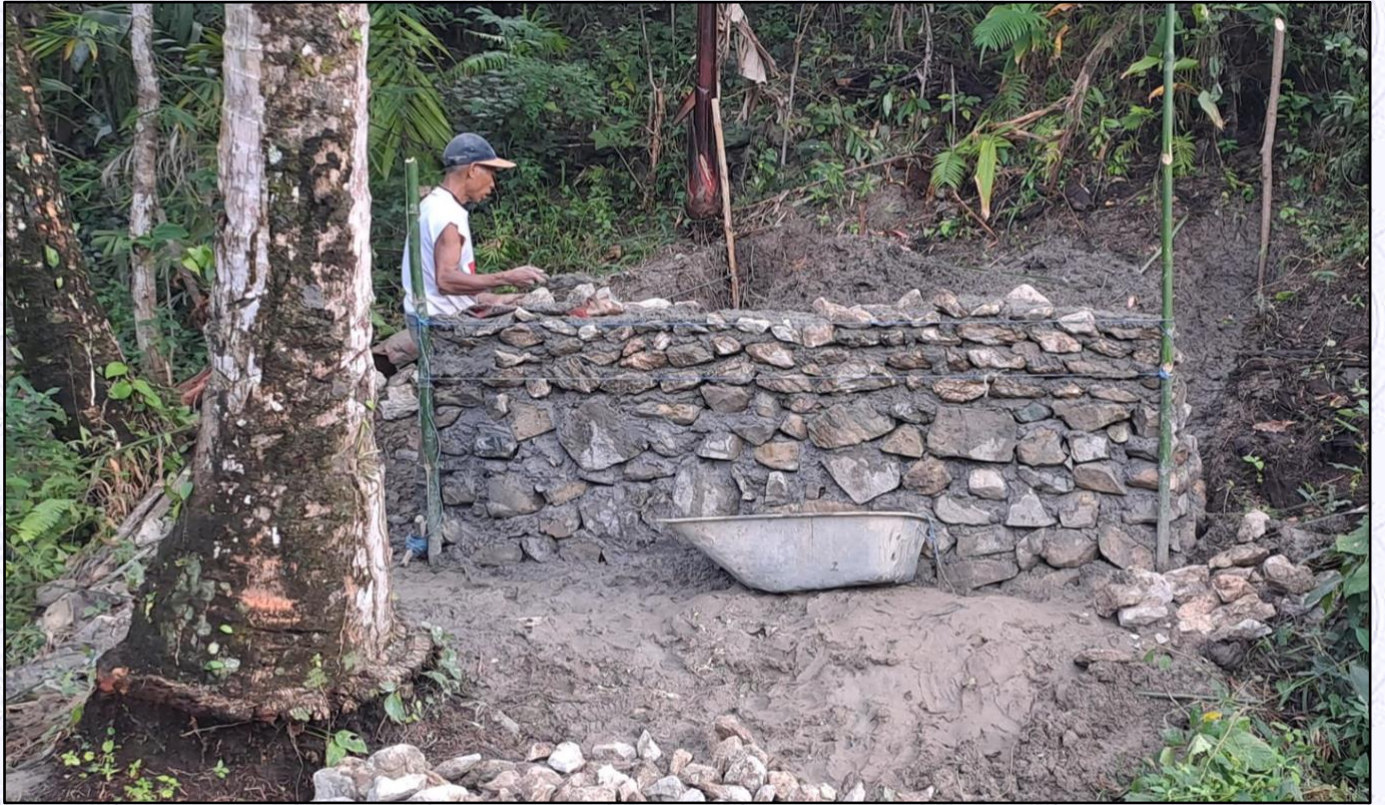
Another tank done and dusted. Now to connect the pump and start pumping water to the school.