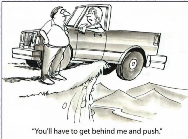
"You'll have to get behind me and push."