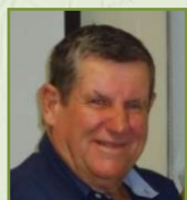
PP. Max Bird International

Ed following up a couple of prospects, also working on a 'Friends of Rotary' database.