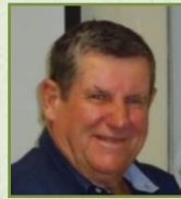
PP Max Bird Foundation Dir.