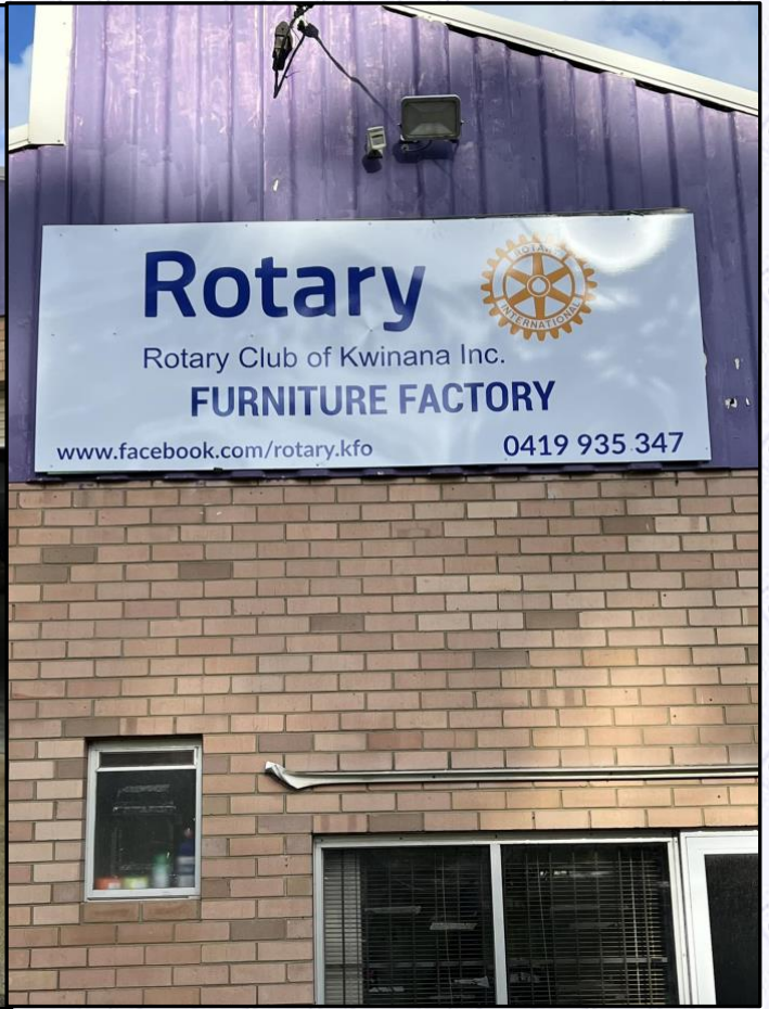
The new home for the Rotary Club of Kwinana Furniture Factory