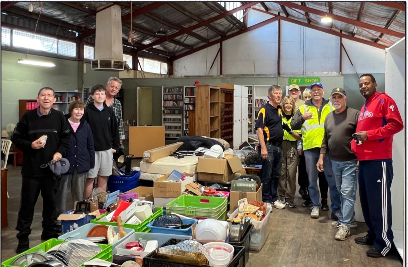
The Saturday Crew, assisting with the move to 26 Seabrook Way, Medina