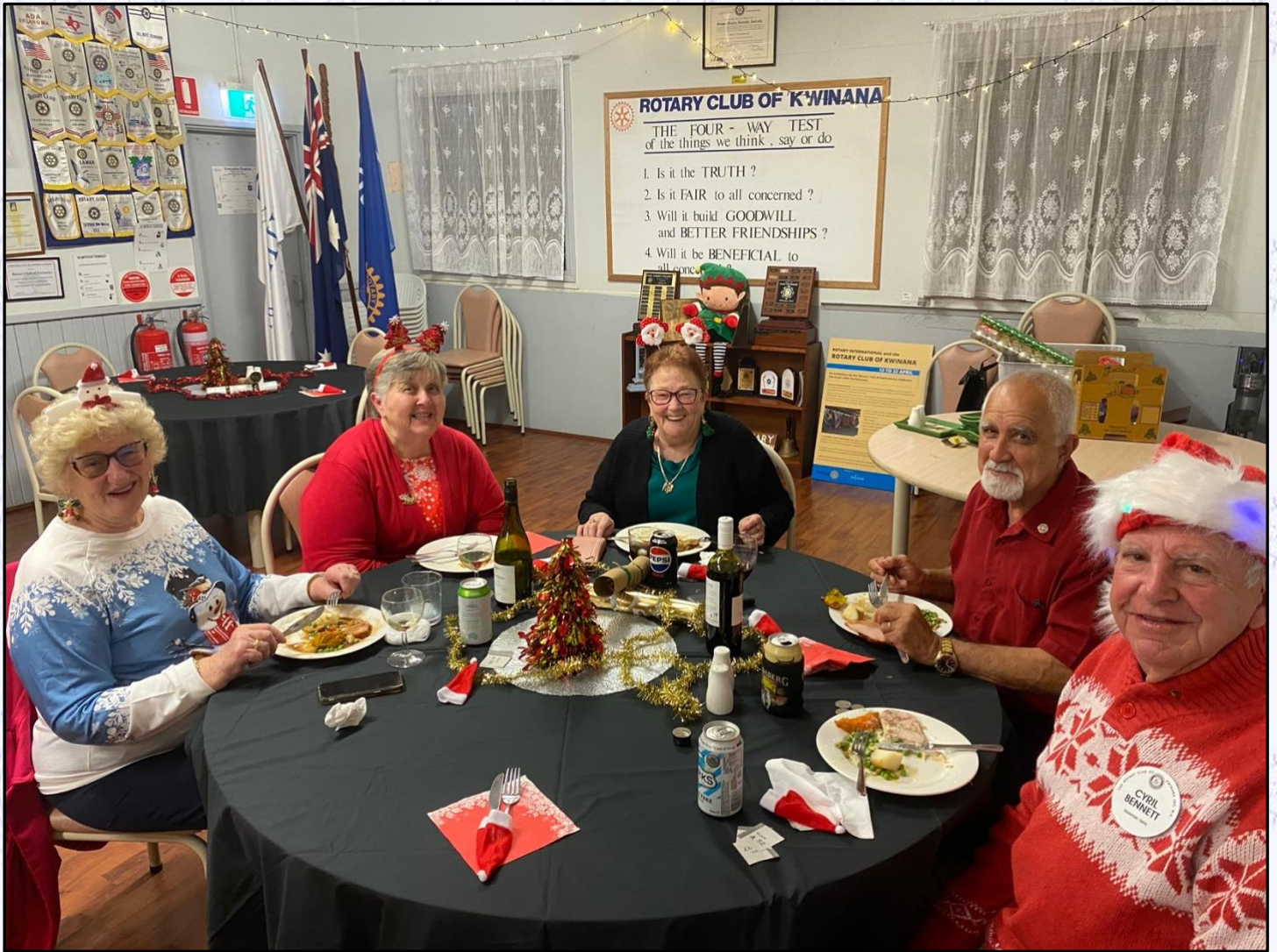
Pictures below from the Christmas-in-July function held on Sunday 28 th July 2024