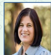
District Governor 9465