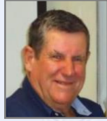
PP Max Bird Foundation Dir.