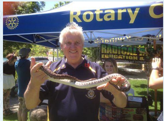
A new friend???