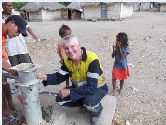
One of the original team members to travel to Dili, East Timor