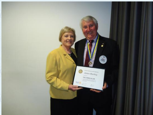
Receiving his well-earned Paul Harris Fellow

What I know now that I wish I knew at 16: I knew everything at 16!!!