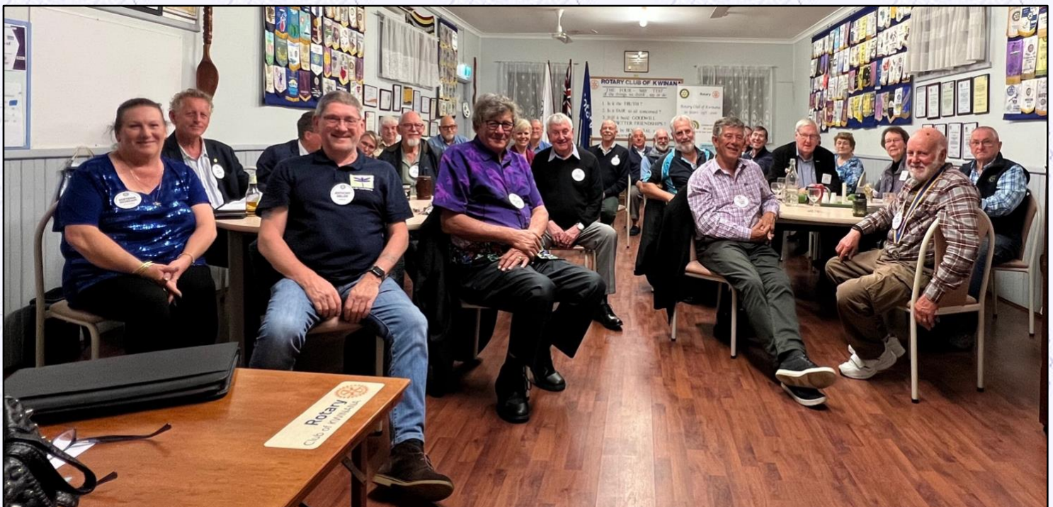
Meeting Monday 28 th August 2023 at Rotary Hall.