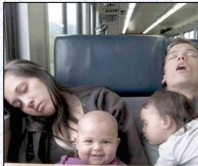
Guess who kept everyone awake last night?