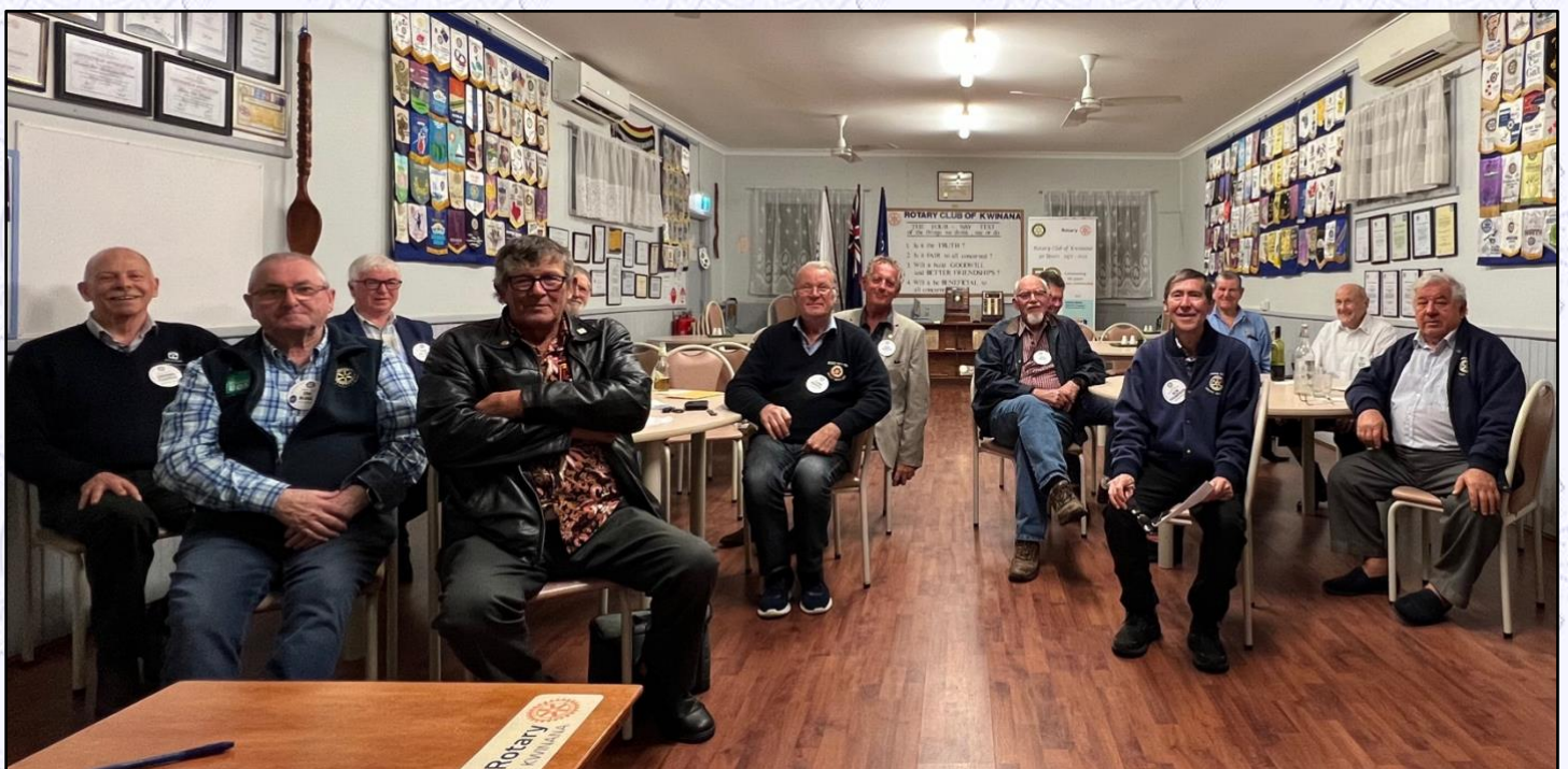
Meeting Monday 04 th September 2023 at Rotary Hall.