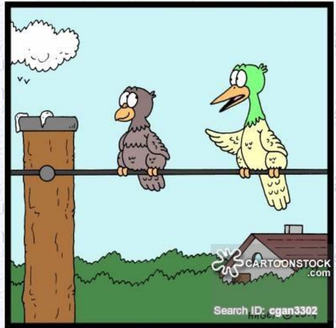
I'm a bit worried about their obsession with Wireless Technology: Soon, we may have nowhere to perch...