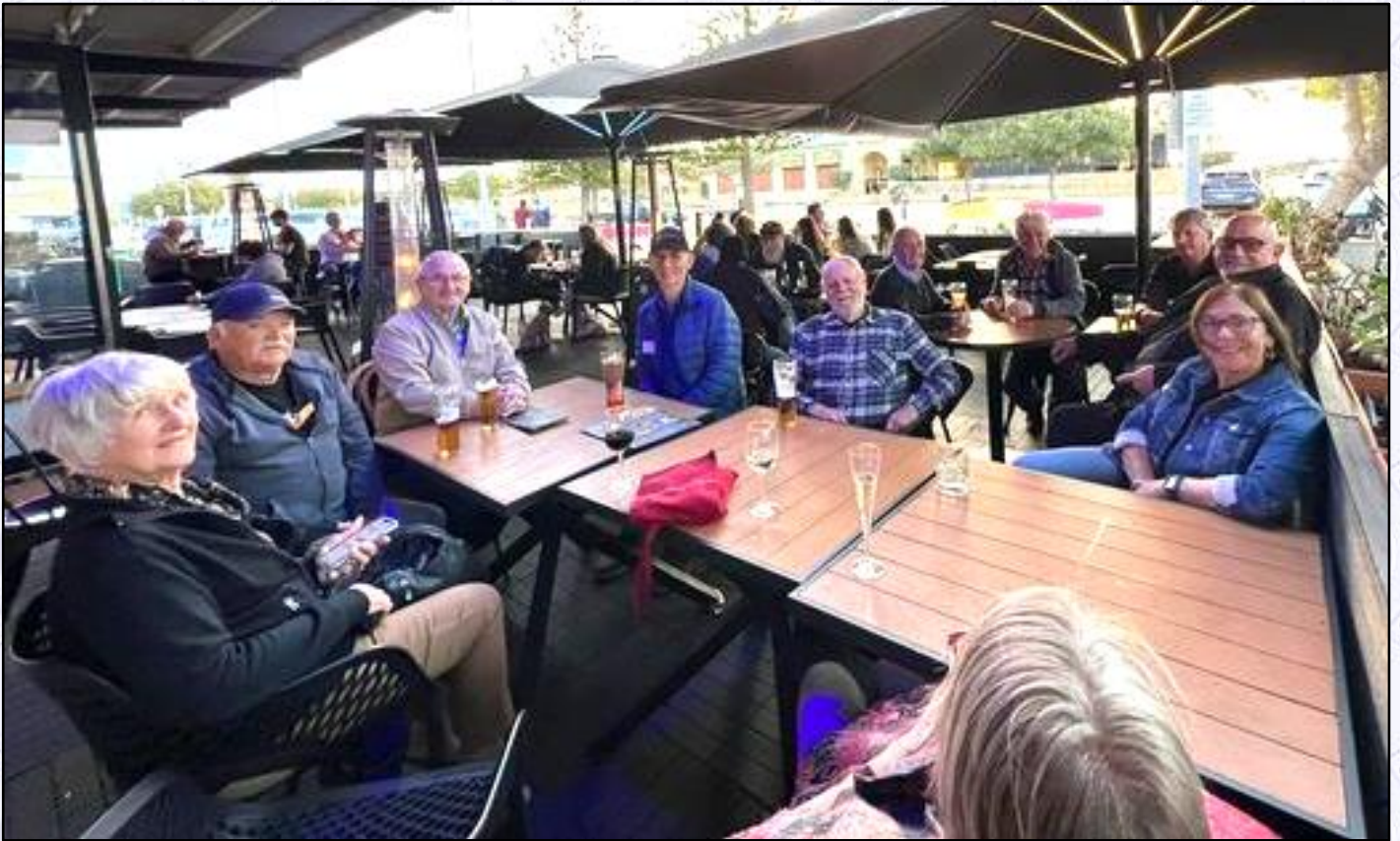
Meeting up at the caravan park

Visit to Geraldton, meeting up with Geraldton Rotarians for drinks and dinner.