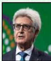
Rotary International President 2025/26

On behalf of Rotary Kwinana, we send our very best wishes and thanks for your 35 years of friendship and commitment to this Rotary Club and the Kwinana Community, you will be very sadly missed.