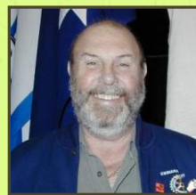
PP Ian Critchley Foundation