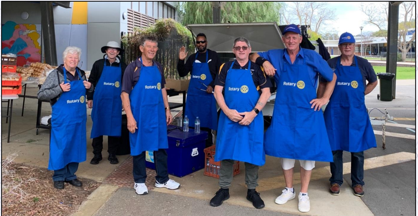
The 'Kwinana Rotary Team' at the recent RUOK BBQ at Gilmore College