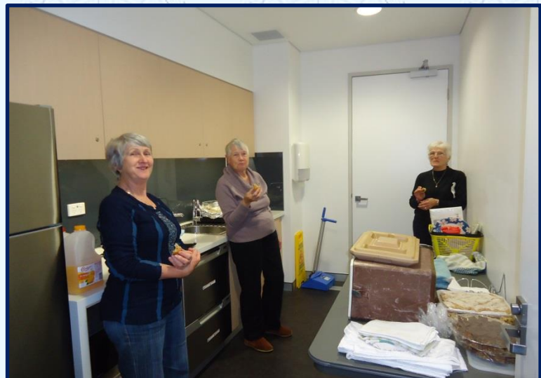
Inner Wheel ladies testing the quality