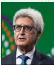
Rotary International President 2025/26