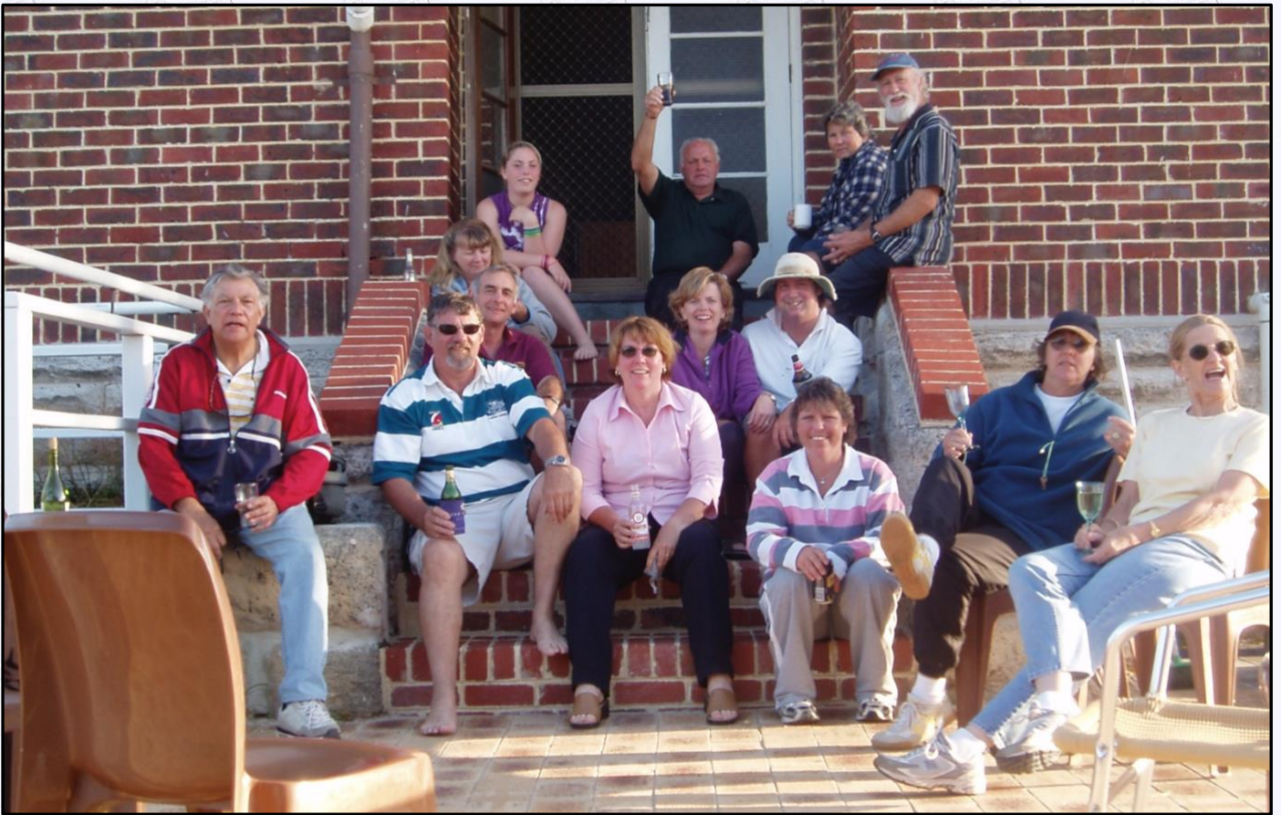
Car Rally 2004