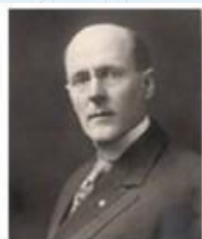
Paul P. Harris

- Rotaryhba.org/our-history/paul-p-harris-rotarys-founder/