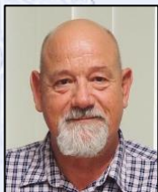
Peter Schulz Vocational