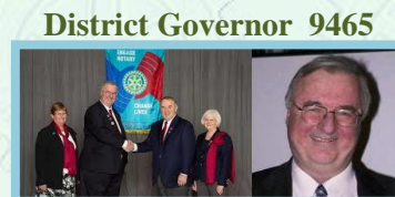
District Governor 9465