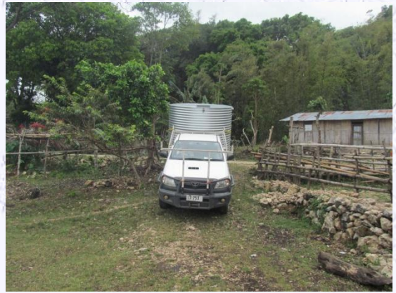
About to install water tanks at the local school