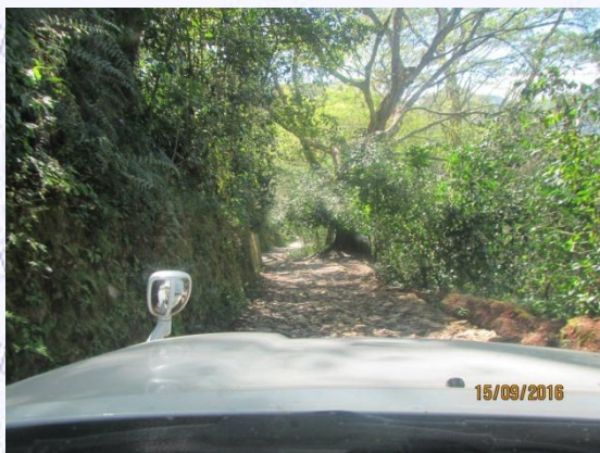
Probably best not to think about this!!!