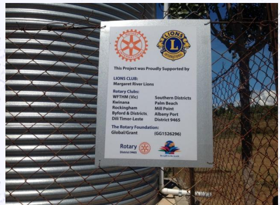
Good acknowledgement of Rotary and Lions