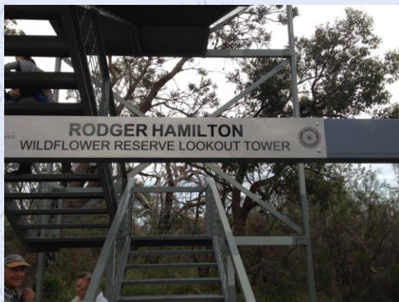
The official plaque