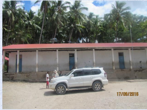
The new roof