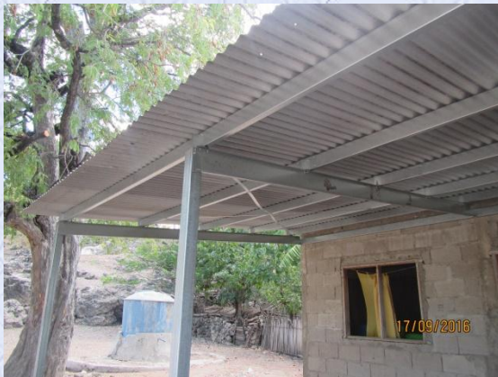
The new kindergarten veranda at Com with a happy crew