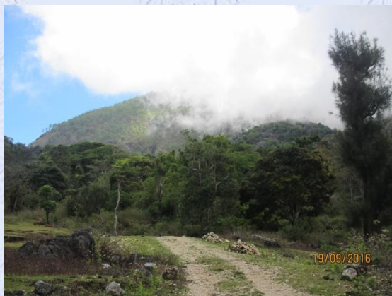
Main road in, and yep – it's going to rain!!!