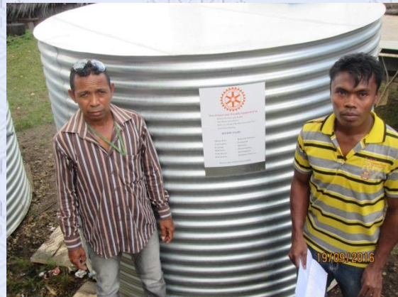
All tanks and poly pipe now at Naha'e