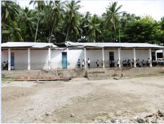
The old roof