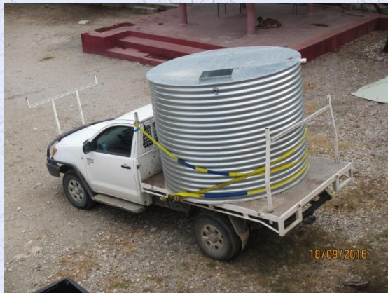
Loaded and ready to go