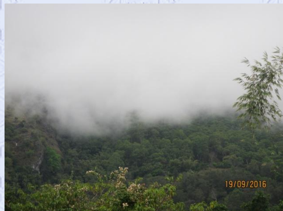
We are in the clouds and it's raining