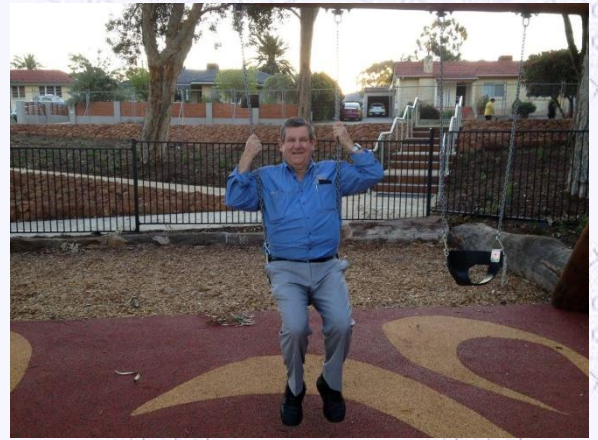
A president's work is never finished!!!