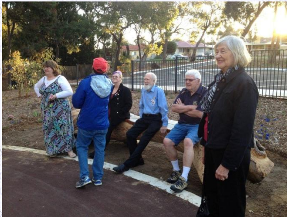
Supervisors on duty