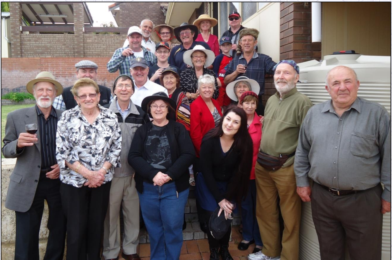
10 years ago this week, Italian Day at the Nella’s in Spearwood