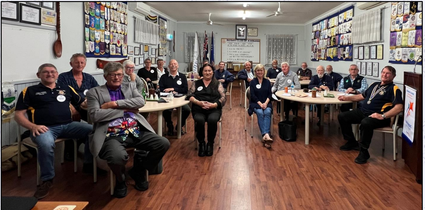
Kwinana Rotary Club, meeting at Rotary Hall, Monday 30 th September 2024

The first hand-held mobile phone call was made on April 3rd, 1973, in NYC.