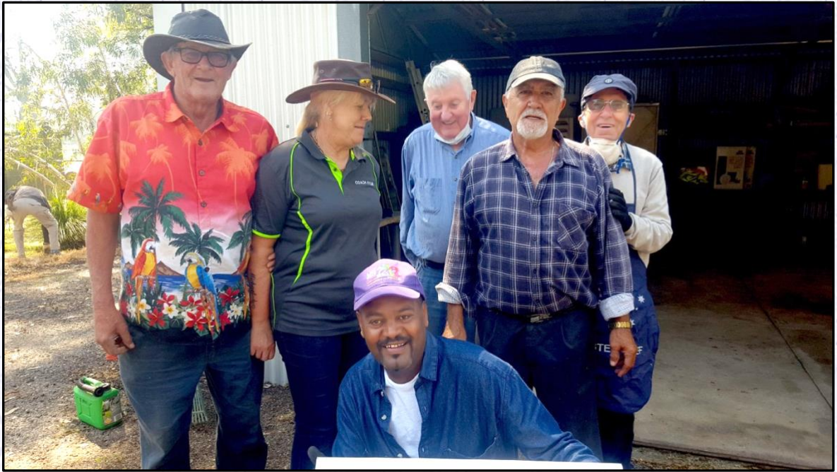
Clean-up, busy bee at Rotary Hall Saturday 28 th September 2024