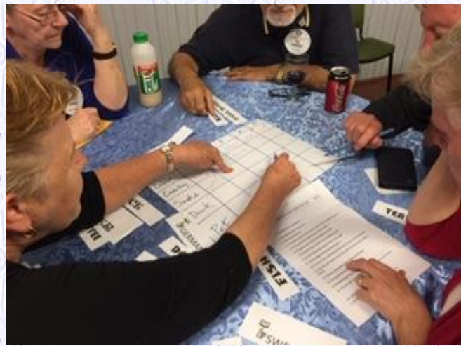
Steadily moving towards solving the puzzle

A great exercise in communication and team work!