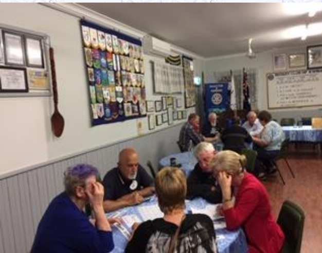
Strategizing each move