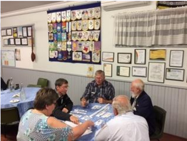
Proceeding with determination