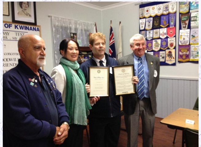
Our newest member!

Never underestimate the impact of a smile, a hug, a word of comfort, listening, honesty, or a kind gesture. Because all of these things can make the biggest difference in someone else's life.