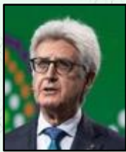
Rotary International President 2025/26

Funeral: 2pm, Thursday 2nd October, Purslowe Funerals, Rockingham.