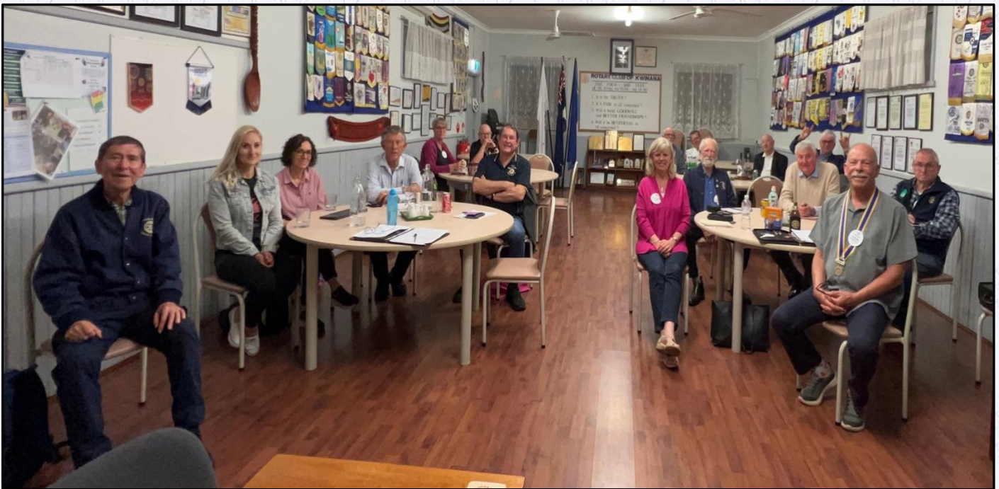
Rotary Kwinana meeting Monday 22 nd Sept. 2025 at Rotary Hall, Medina