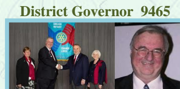
District Governor 9465