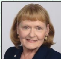
Rotary International President 2024/25 Stephanie Urchick

Kwinana Community Fair 2024 is only 3 weeks away, all I believe is progressing well, stall numbers are good, food outlets are well represented, all is looking very positive, favourable weather will be much appreciated.