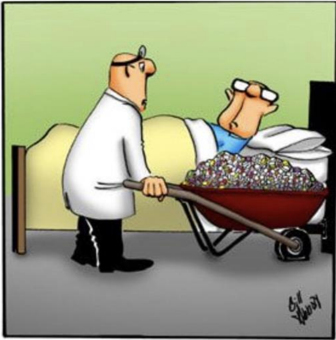
“Time for your morning medication and I’m told you haven’t been eating much.” More lik [👍]