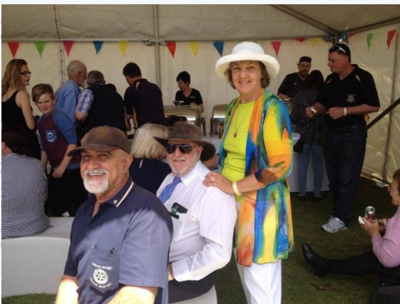
The VIP tent was very pleasant!