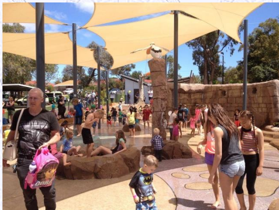
Enjoying a splash