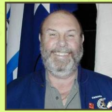
PP Ian Critchley Foundation