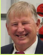
Michael Metcalf Community