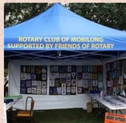
Promotion of Friends of Rotary