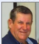
PP Max Bird Foundation Dir.