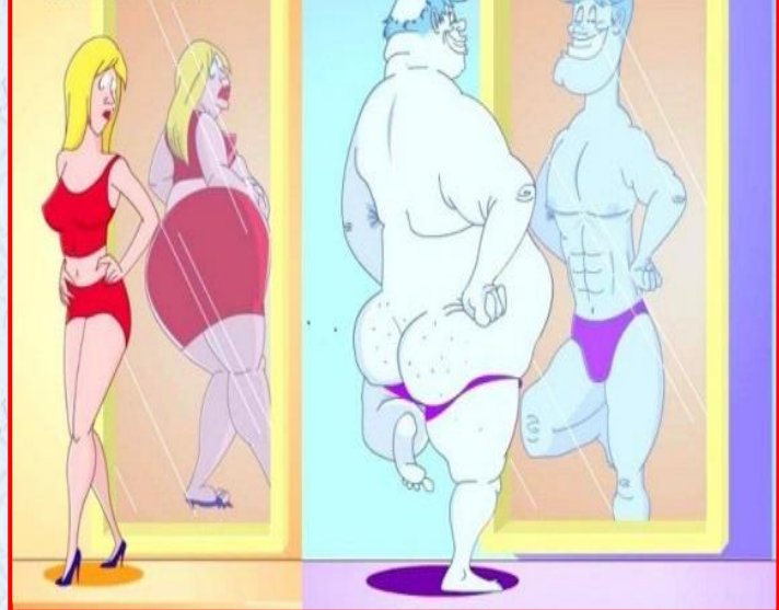
Difference between men and women