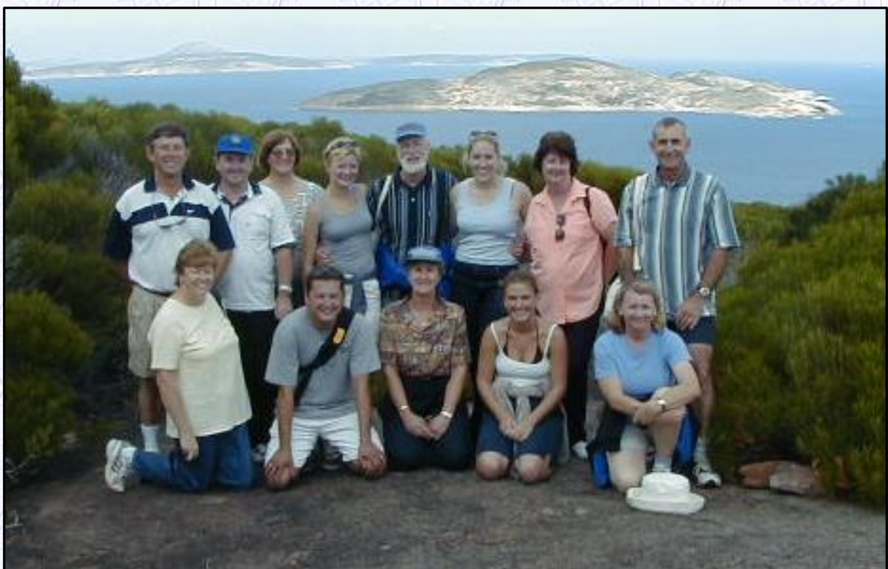
Group photo taken at Esperance, April 2000