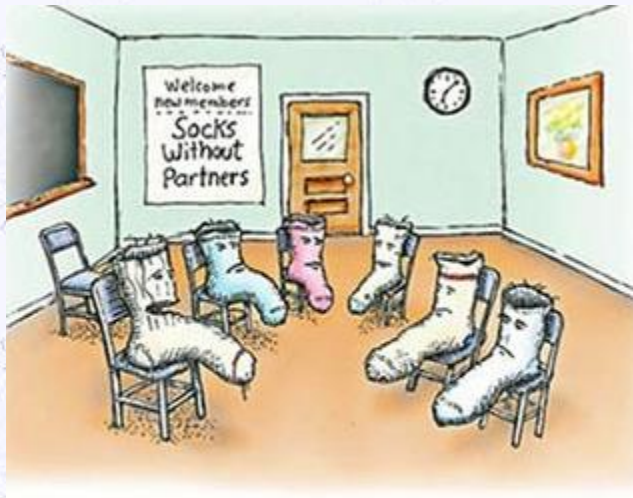
"The last thing I remember is being thrown into the dryer."