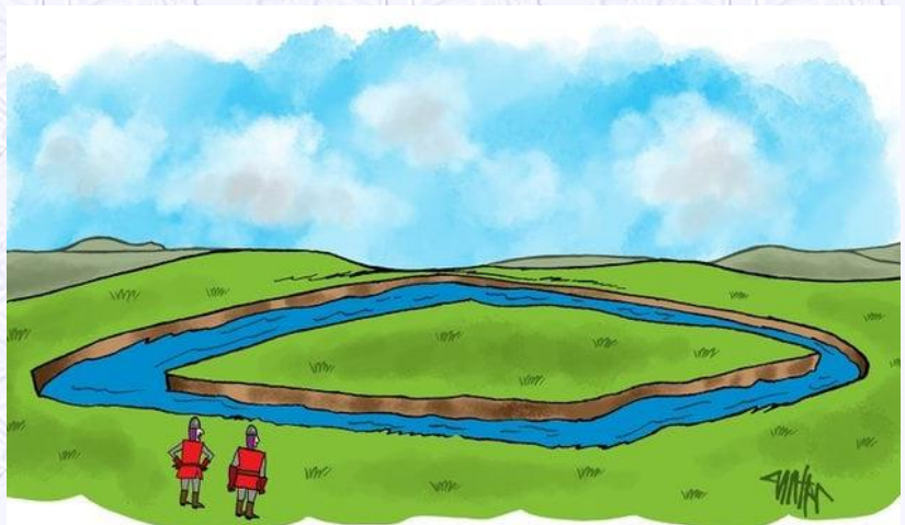
"You're right. We should have built the castle first, THEN the moat."