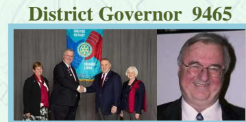
District Governor 9465