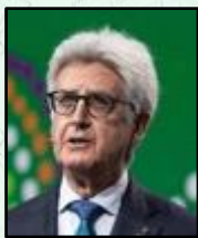
Rotary International President 2025/26

Hope all that 'Ride the Train' on Friday have a pleasant, enjoyable day.