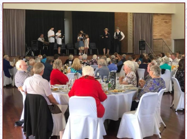
The Lunch was held at the recently refurbished Medina Hall,