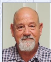
Peter Schulz Vocational

Kwinana Community Fair, great success well attended. Australia Day Breakfast may be on-again, stay tuned.