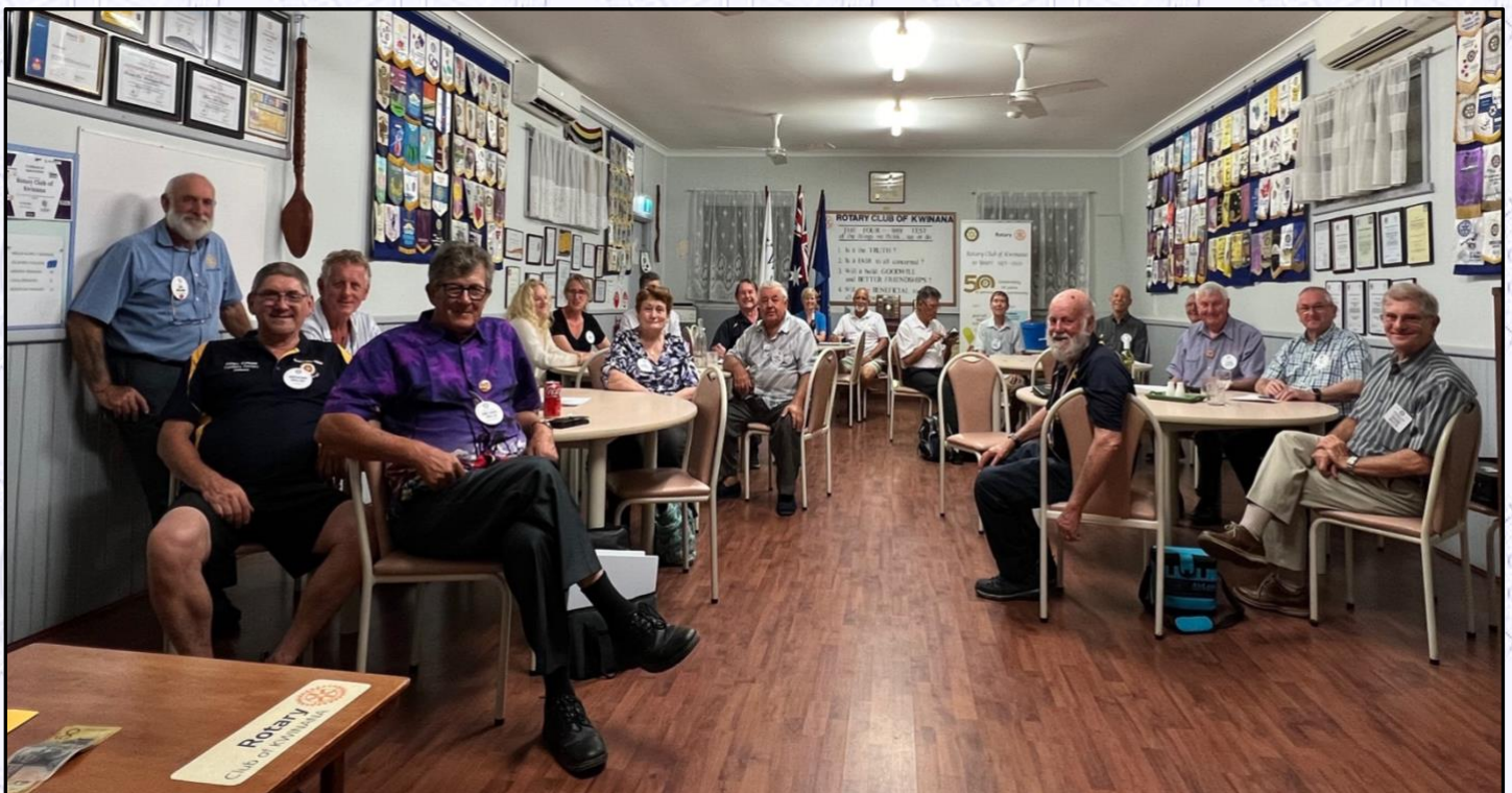
Kwinana Rotary Club meeting Monday 20 th November 2023 at Rotary Hall