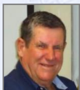
PP Max Bird Foundation Dir.