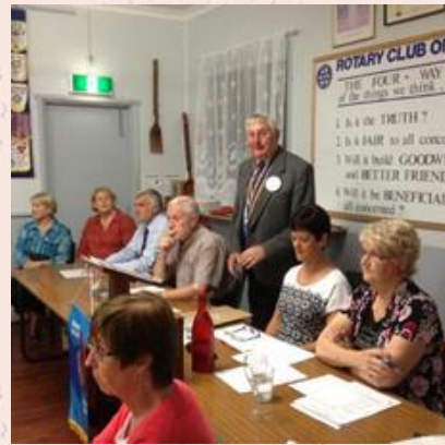
The adjudicators' table