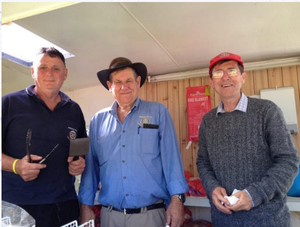
Our BBQ wizards