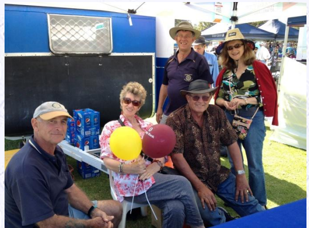
Doing their bit for public relations!